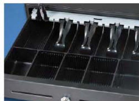
Extra Deep Insert with Adjustable Coin Dividers