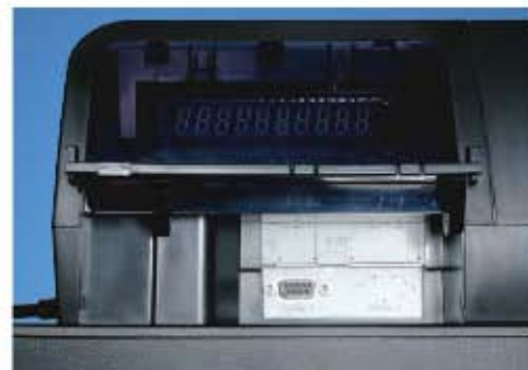
One Standard RS-232C Port Hidden Behind a Convenient, Easy to Access Door