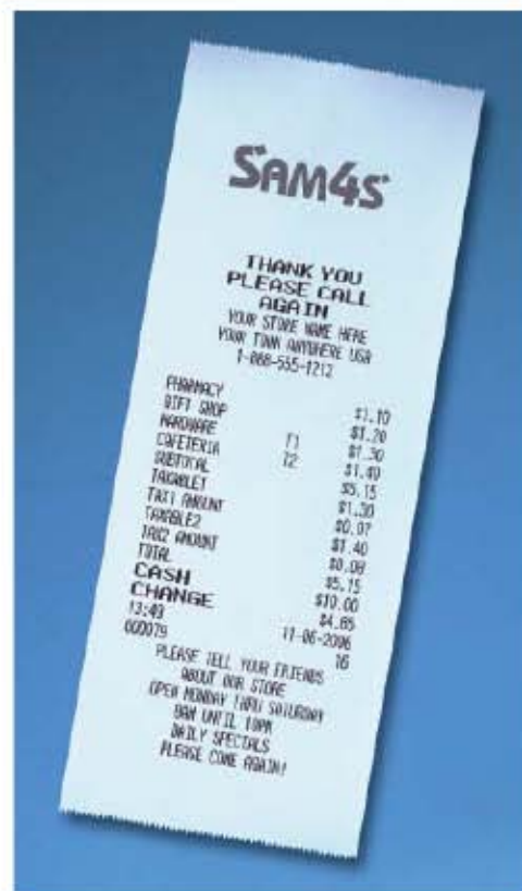
Thermal Receipt Shown 60% Actual Size